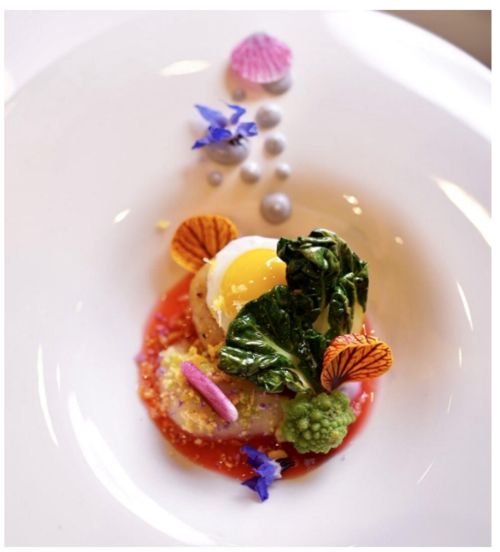
Sea scallop with blood orange broth and microgreens is a chef's special at Blume.