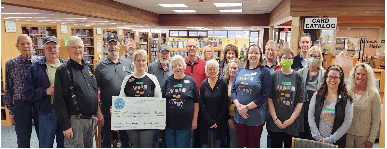
Harlan Community Library 718 Court Street, Harlan Tuesday, April 25, 2023