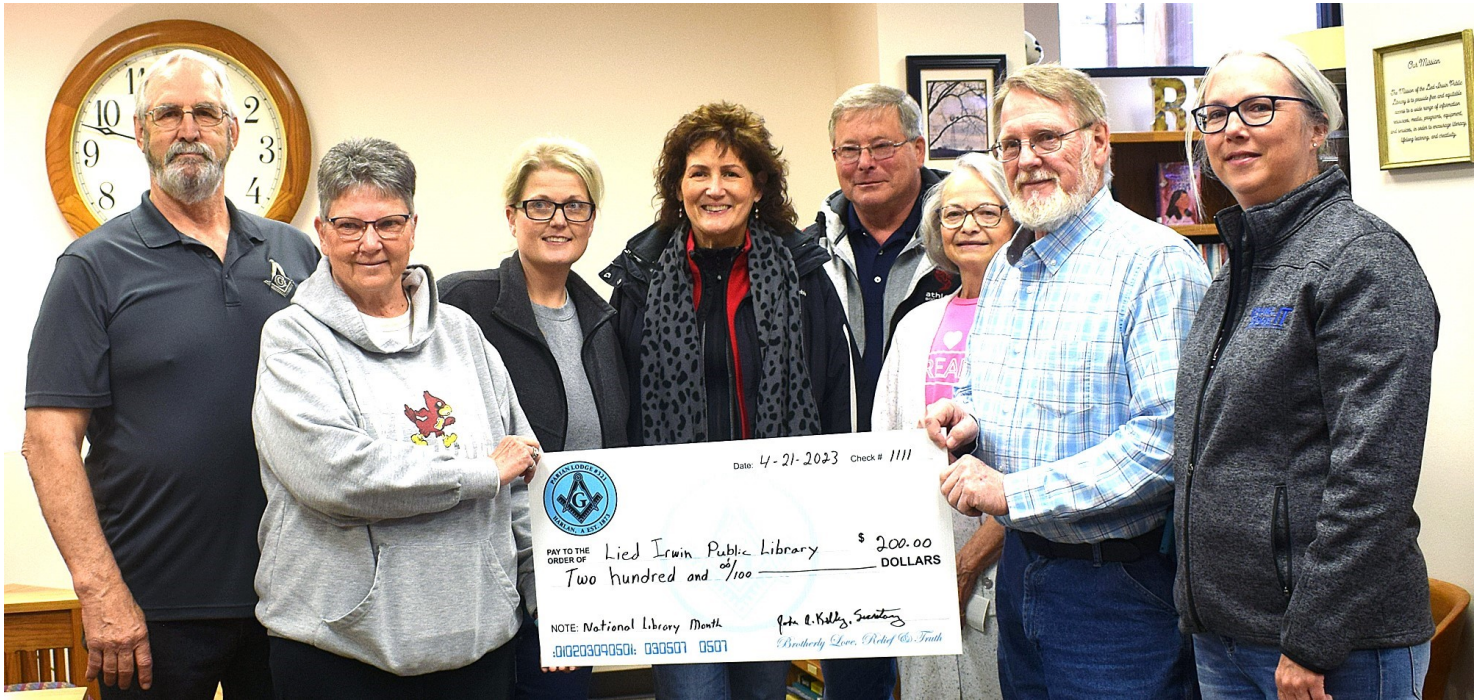
Lied Irwin Public Library 509 Ann Street, Irwin Friday, April 21, 2023

All three of our libraries hosted ambassador visits to celebrate National Library Week. This year's theme - "There's More To The Story". Thank you all for what you do. We truly appreciate you.