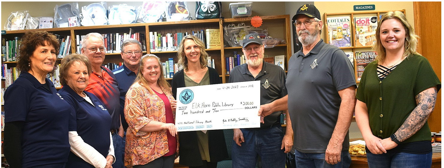
Elk Horn Public Library 2027 Washington Street, Elk Horn Monday, April 24, 2023