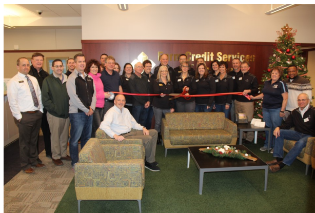
Ambassador Visit/Ribbon Cutting Ceremony Farm Credit Services, Harlan December 18, 2019