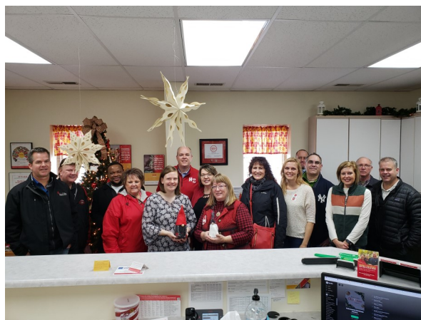
Ambassador Visit Shelby County ISU Extension & Outreach, Harlan December 6, 2019