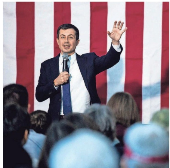
Pete Buttigieg speaks to a standing-room-only crowd during a town hall on Saturday in Harlan.