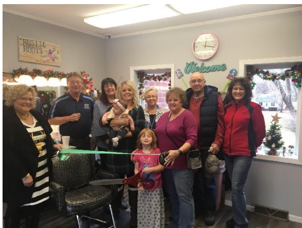
Ribbon Cutting Ceremony Rustic Roots Salon, Elk Horn November 30, 2019