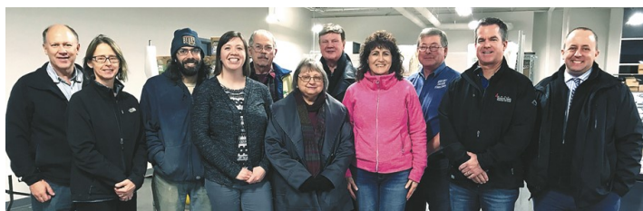
Ambassador Visit FarmTable Procurement & Delivery, Harlan December 13, 2019