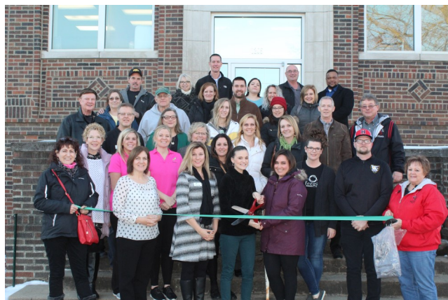
Open House/Ribbon Cutting Ceremony The Old Harlan Library, Harlan January 14, 2020