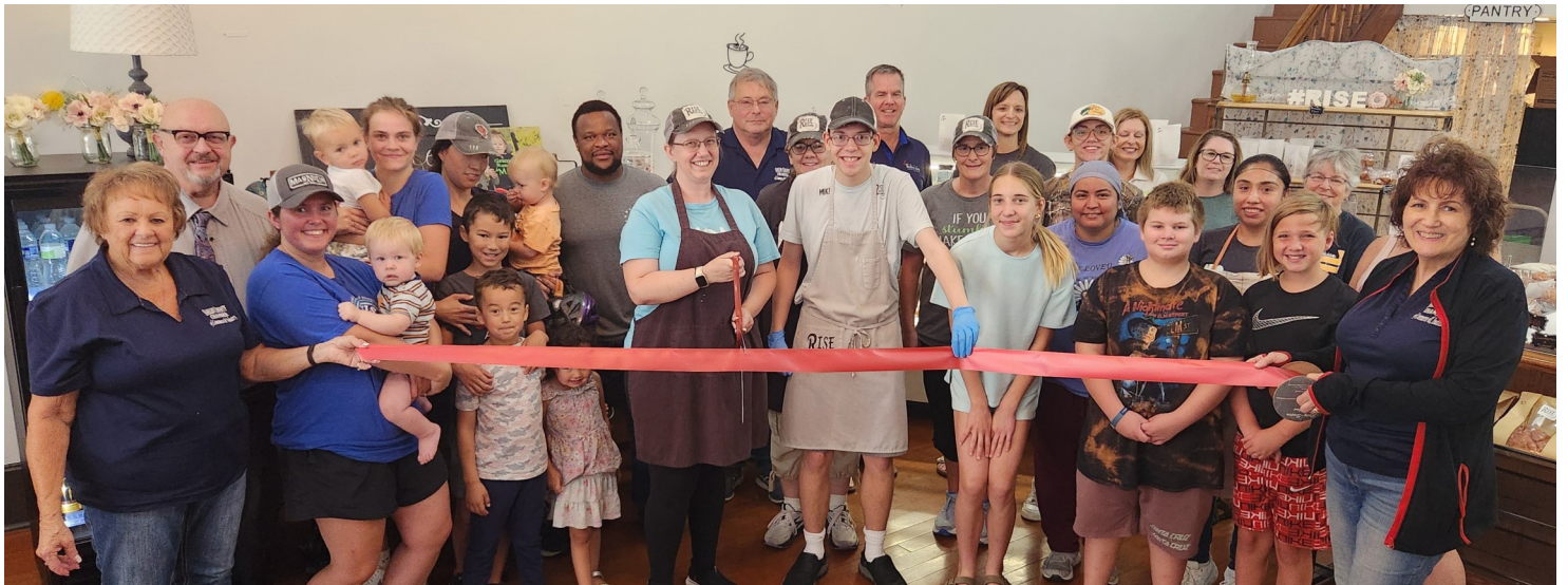
Ribbon Cutting - Christian's Rise Donuts, 614 Market Street, Harlan, Friday, July 26