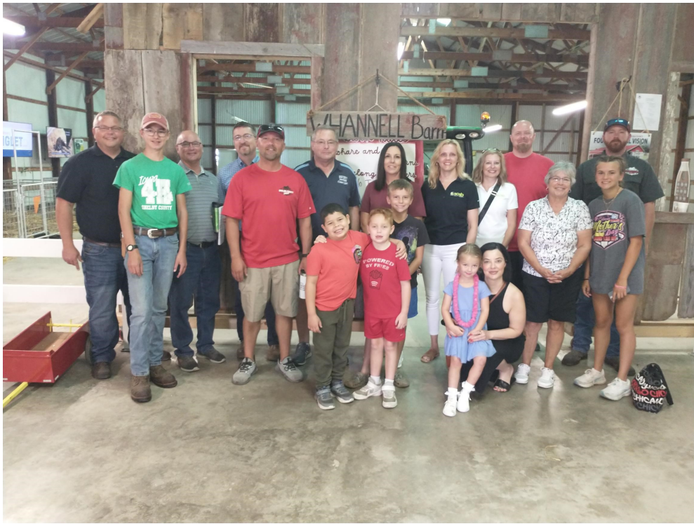
Ambassador Visit - Shelby County Fair Board Farm Bureau Ag Pavilion, Shelby County Fairgrounds, Harlan, Friday, July 12