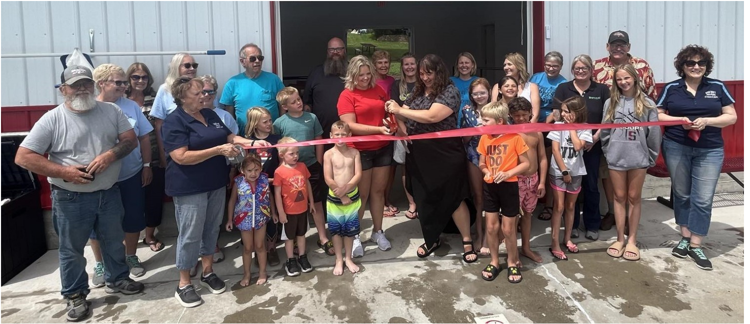
Celebrating the new Elk Horn City Pool House, hosted by the City of Elk Horn