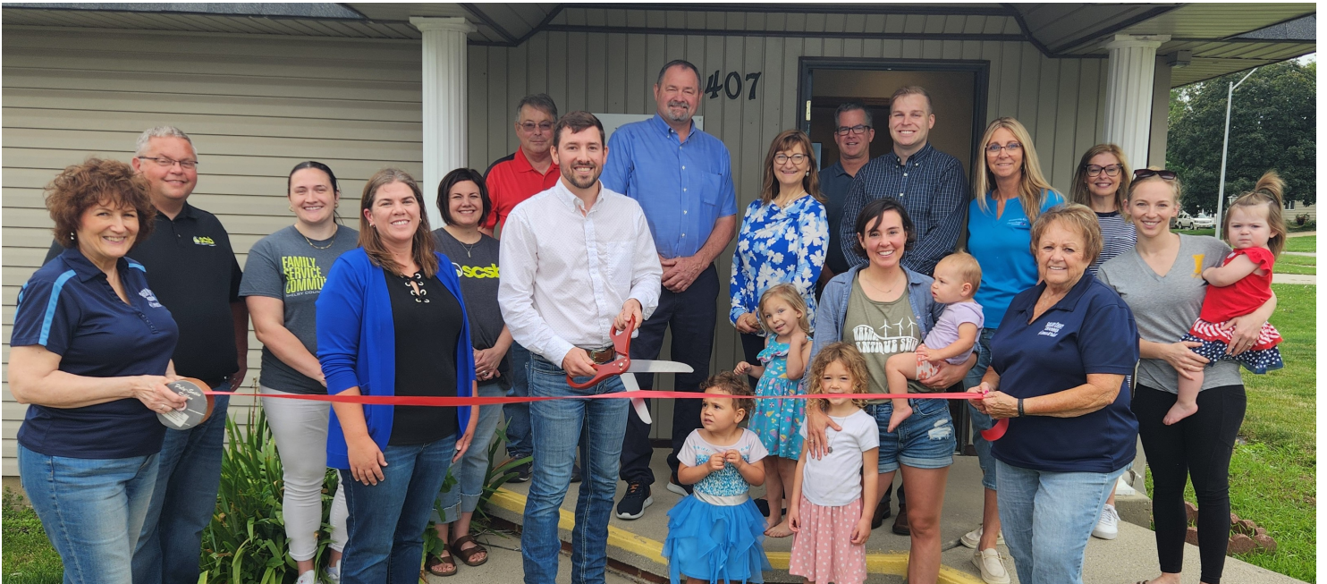
Celebrating a new location. Hamilton Financial Services, 1407 Garfield Avenue, Harlan