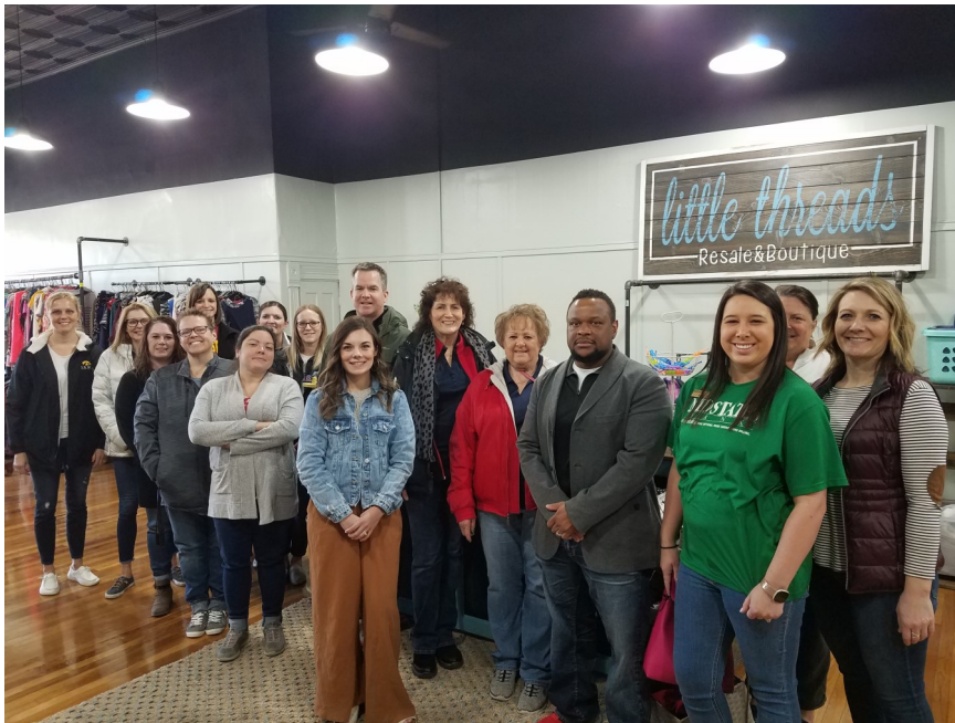
Ambassador Visit: Little Threads Resale & Boutique, Harlan Friday, March 25, 2022

Contact the Chamber office at 712-755-2114 or email us .